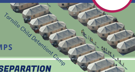
Tornillo Child Detention Camp