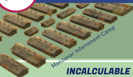
Manzanar Internment Camp